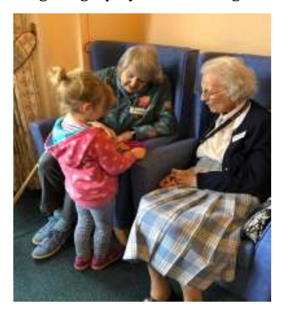
We've also made Bird Feeders, Coloured in Pictures of Birds & looked at pictures of birds we may see in the Garden.