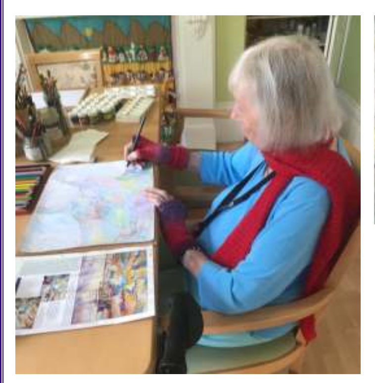
Art Group The Art Group have been busy showing us their Artistic Talents.